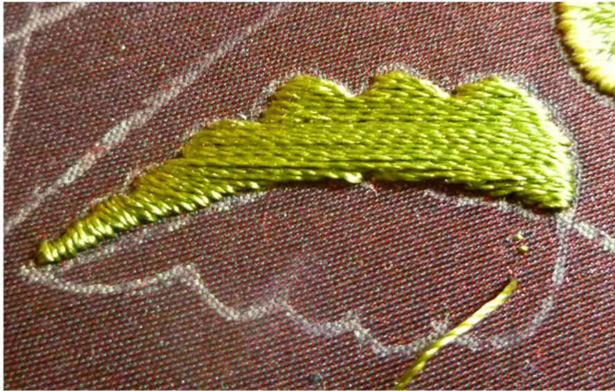
13: Medium green in laid satin stitch over padding